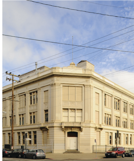
Pier 70, Building 101

The structural rehabilitation of Building 101 has been equally as challenging as that of Buildings 113-116 and Nibbi has been up to the task. The team has shown an unwavering dedication to the client by embracing the vision—despite seemingly insurmountable structural complexities associated with renovating a building of this type.