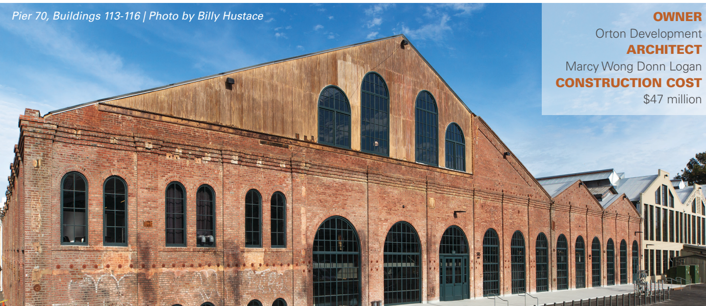
Pier 70, Buildings 113-116 | Photo by Billy Hustace

Rendering Courtesy of Kennerly Architecture and Planning