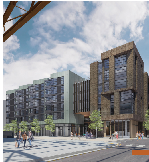
Pier 70, Building E2

Rendering Courtesy of Kennerly Architecture and Planning