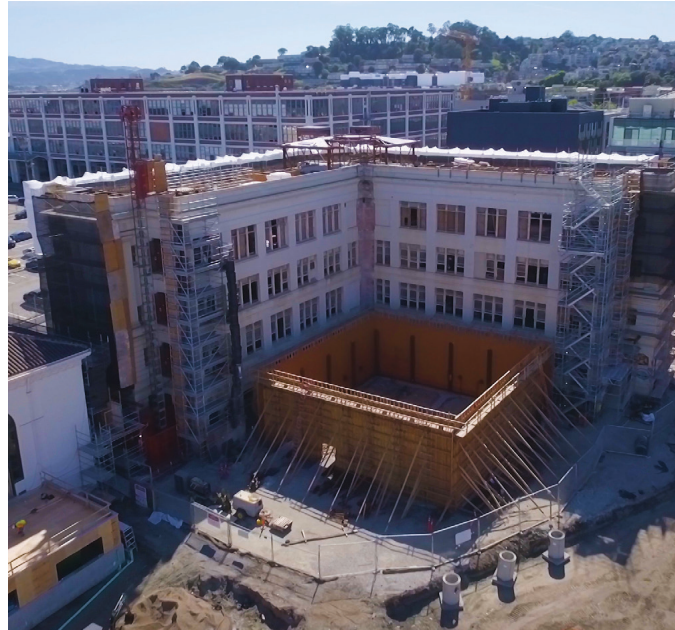
Pier 70, Building 101

One of the more significant challenges was completing the foundation. Getting the materials in the building, in the basement, where we drilled 30 micropiles to bedrock, was a feat in itself. The basement had limited access and low ceilings, so Nibbi brought the materials in by hand.