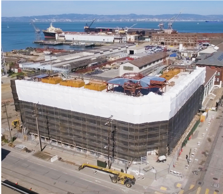
Pier 70, Building 101