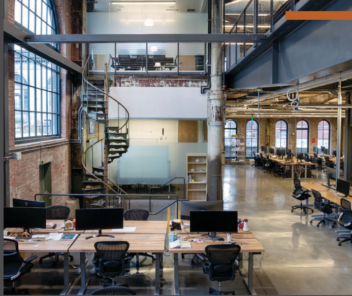
Pier 70, Buildings 113-116 | Photo by Billy Hustace

Pier 70 has been in the spotlight lately—buildings 113-116 won ENR’s 2018 regional and national Best Projects Award in the Interiors/Tenant Improvement category. But Pier 70 is more than just a restoration and adaptive reuse of dilapidated buildings. It’s a revitalization of an abandoned district into a vibrant, culturally rich neighborhood that embraces the character spanning three centuries of San Francisco. And Nibbi is contributing to this transformation in more ways than you’d expect.