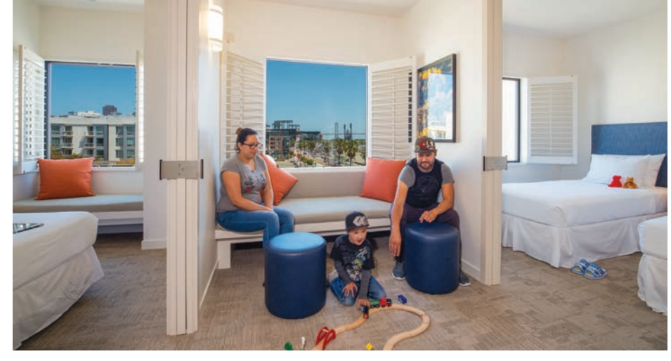
Families are referred to Family House by social workers at the Children's Hospital and must travel from at least 50 miles outside San Francisco. Recently, one of the families came from as far away as Tibet!

At five stories, the impressive new facility can accommodate 80 families. almost triple the capacity of the previous two buildings combined. It also accommodates all Family House staff in one office location. The U-shaped building design provides a central courtyard with plenty of natural light. With environmental features, including