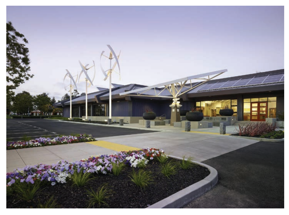
The Zero Net Energy Center leads the nation's sustainable building standards by planning to meet the California Energy Commission's 2030 Net Zero Energy Challenge 17 years ahead of schedule.

stok has provided strategic sustainability services for several Nibbi-built projects — the Mission Clubhouse for Boys & Girls Clubs of San Francisco (a zero-energy project), St. Peter's Place (the second-highest rated GreenPoint project in the U.S.) and the on-going rehabilitation of historic structures at San Francisco's Pier 70 historic district, to name a few. One of the company's most noteworthy current projects is the Salesforce Tower. More information on NZE buildings is available at www.stok.com.